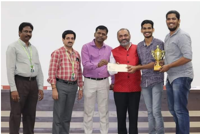
Volunteers of the event with the chief guest