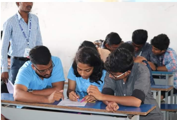
First round of the event